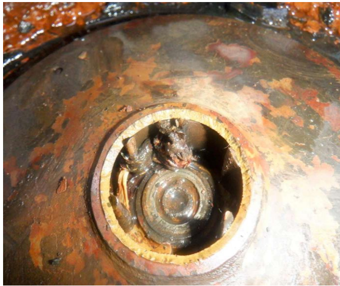
Figure 5 feed pump components affected by corrosion.

To handle the feed pump that has been corroded, initially the crew wanted to replace several pump components that were no longer feasible. However, this was not possible, because the components were stuck due to corrosion, and the pump casing was also mostly corroded. After checking the spare part room, a set of feed pump oily water separator along with its electric motor was available (Sulaiman & Suharto, 2020), so the effort to overcome the decrease in exhaust volume in the oily water separator at SS. Golden Isaia was to replace a set of OWS feed pump along with its electric motor showed in in Figure 6.