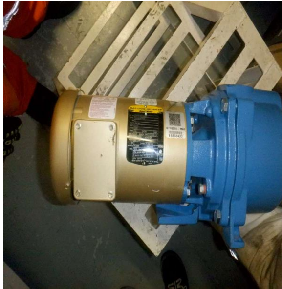
Figure 6 One set of OWS feed pumps