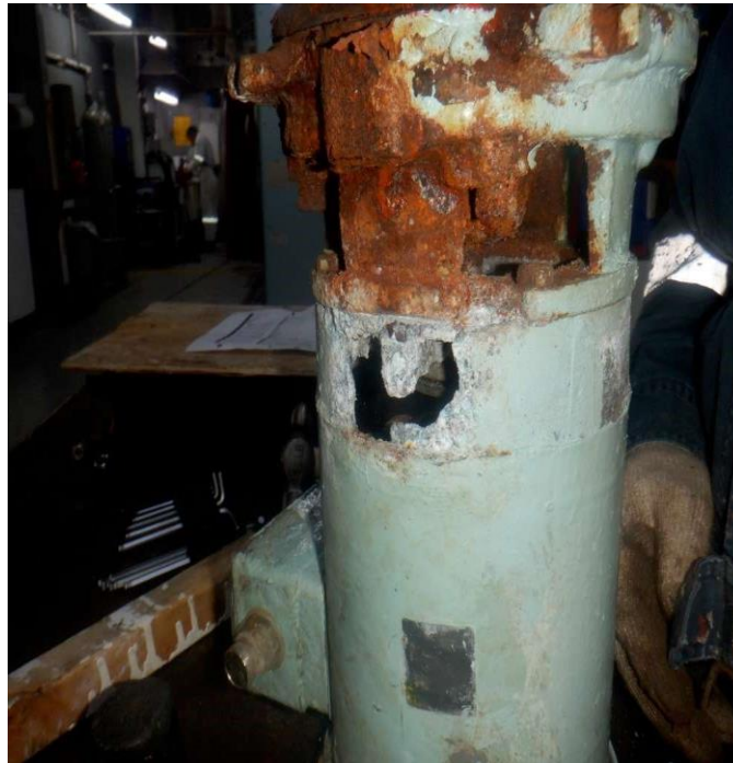
Figure 3 Condition of the feed pump oily water separator

Based on data from observation results, it has been found that the engine factor causes a decrease in exhaust volume in the oily water separator in SS. GOLDEN ISAIA is in the feed pump, the feed pump is a component of the oily water separator that sucks sewage water from the bilge tank through the HELI-SEP Separator tube and then presses it toward the filter. The pressure of this pump is one of the main causes of a decrease in exhaust volume in the oily water separator showed in Figure 3, when conducting observations during the operation of OWS it was found that the feed pump pressure was less than the normal working pressure according to the manual book.