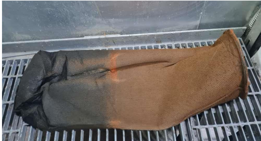
Figure 4 Filter Bag in the oily water separator filter process