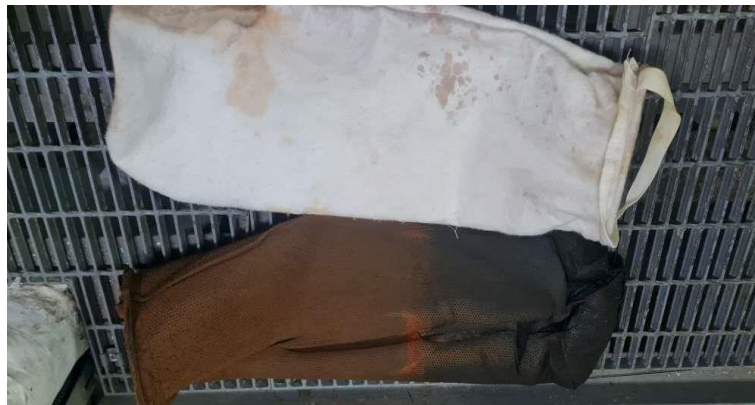
Figure 7. Replacement of OWS filter bag

Based on data collected from observations, interviews, and literature studies, efforts to overcome the cause of dirt accumulation in the bilge tank process filter are to clean the strainer and replace the filter bag. This is done based on the manual book instructions (Ardhi et al., 2018). Inside the strainer of the process filter there is a filter bag as a double filter. The instructions in the manual book state that the filter bag must be replaced if the pressure differential before and after the process filter reaches a pressure of 1 bar showed in Figure 7