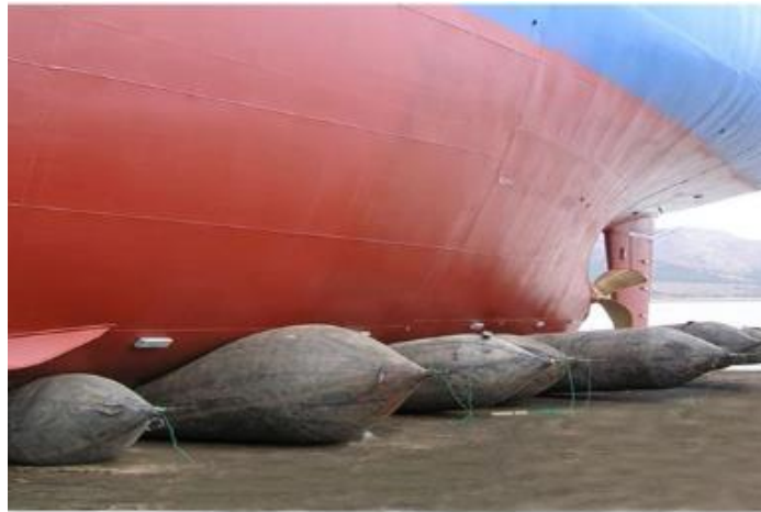
Figure 4. Ship Launching Using Airbags

The ship will move slowly, if everything goes smoothly the ship will arrive at the dock. If the ship successfully reaches its destination safely, the next step is to measure the bow draft and also check the ship's stern. The ship must also be checked in the cabin whether there are leaks or not.