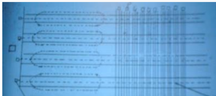
Figure 1. Transverse Slipway

The shipyard has three facilities, namely slipway, Graving Dock, and Floating Dock. Slip way is a simple tool that has the function of raising and lowering a ship that is to be repaired. The length of the slipway is designed to be no less than 2.5 the length of the largest ship. There are two types of slipway, namely longitudinal slipway and transverse slipway.